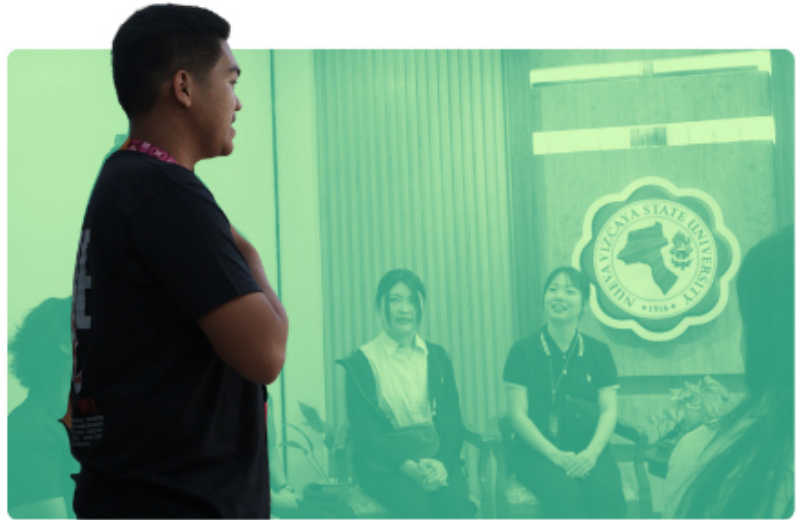
Mie University delegates, together with their NVSU counterparts, exchange introductions upon their arrival at the Office of the President, marking the start of their engagement under the Summer School Exchange Program.